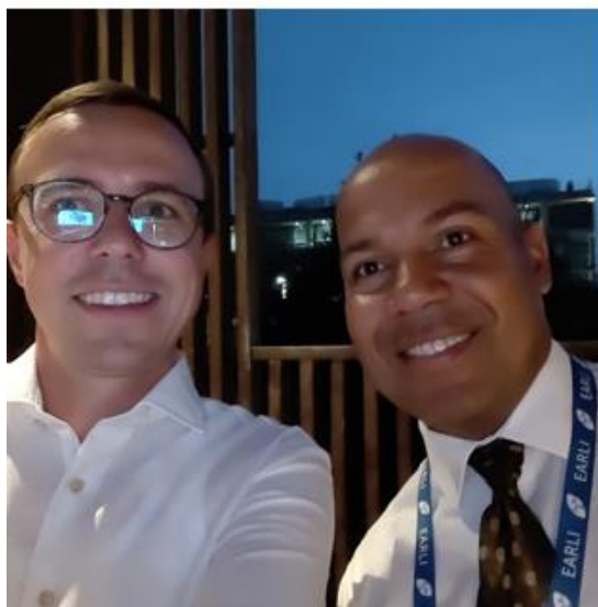
Dinner after Business Meeting