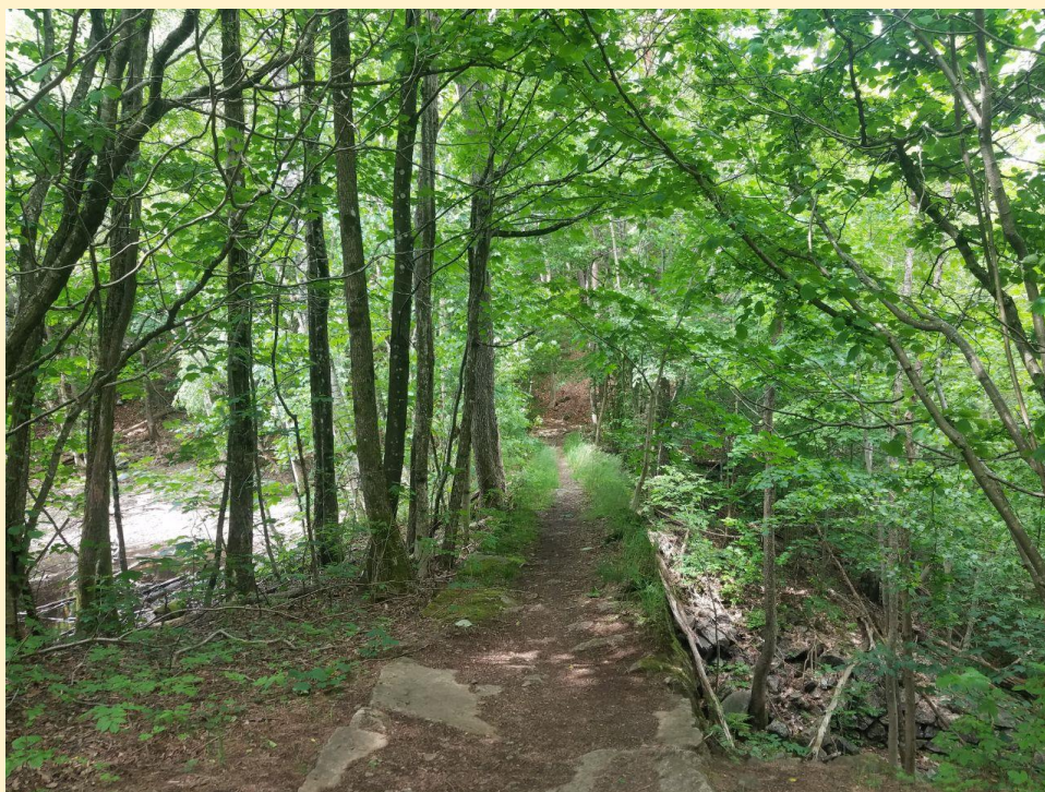
Lush forrest near Kristiansand