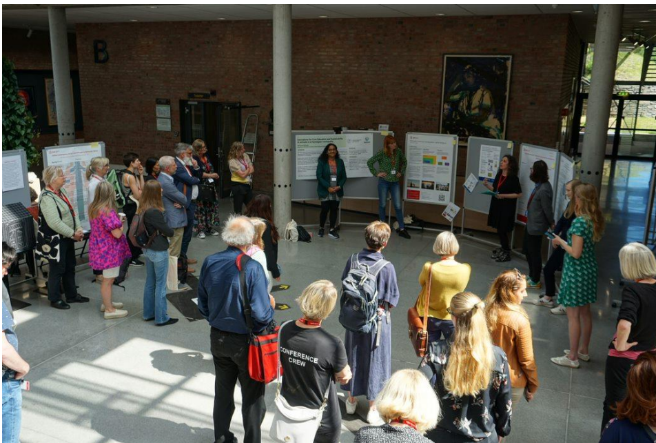
Poster Presentation at the SIG 13 conference

I traveled together with two others from the Faculty of Educational Sciences at the University of Oslo. On Tuesday 14th of June, we went on a boat trip with M/S Maarten, arranged by the SIG 13 committee. The boat took us through the beautiful archipelago of Kristiansand. This was a nice way to start the SIG 13 Conference, as participants could meet and greet.