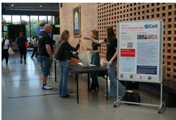
The welcoming desk of the SIG 13 conference

It was with new knowledge, insight, and inspiration that we closed the conference off the last day. After a lovely conference dinner, the night before, and yet another keynote and a round of paper sessions Friday morning, we closed off and offered are grateful and humble thanks to everyone that had joined the conference. I will use this opportunity to offer my sincere thanks to those of you that attended the conference physically, or virtually via zoom. It was for me a big event to take part of and organise, and I feel honoured to have been part of it.