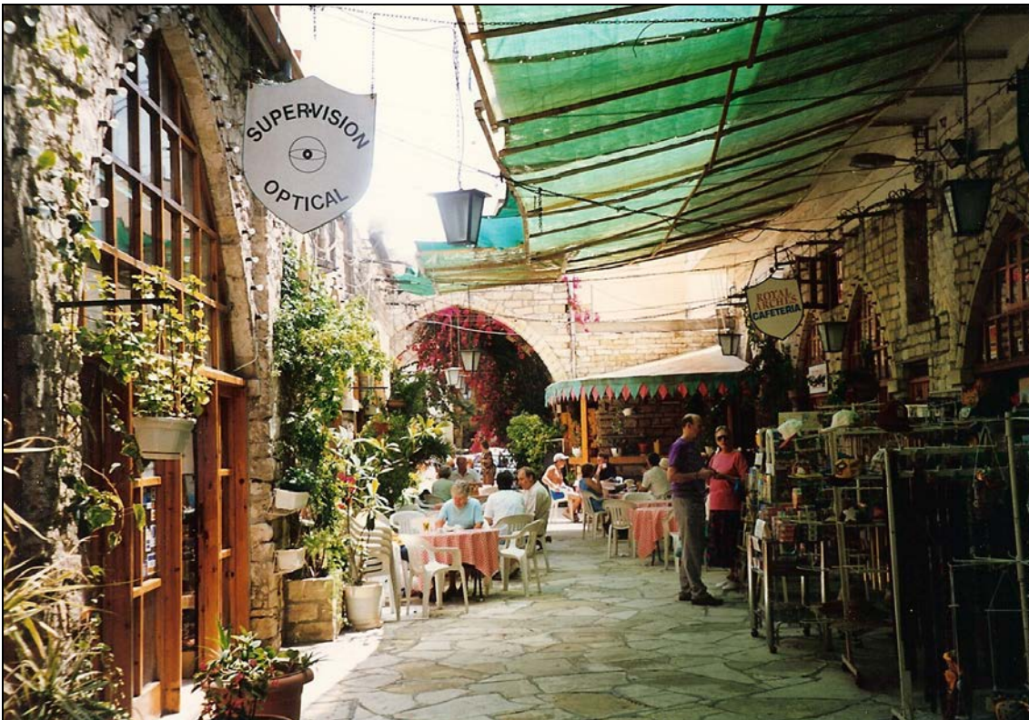
The Old Town in Limassol (by Bayreuth2009)

https://commons.wikimedia.org/wiki/File:Altstadt_Limassol_Zypern_%2801%29.jpg