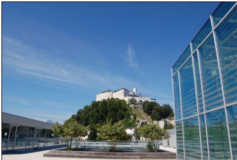
The University of Salzburg ( provided by the Symposium organisers )

All topics dealing with moral and democratic education are welcome – including those not addressing the main theme of the conference specifically.