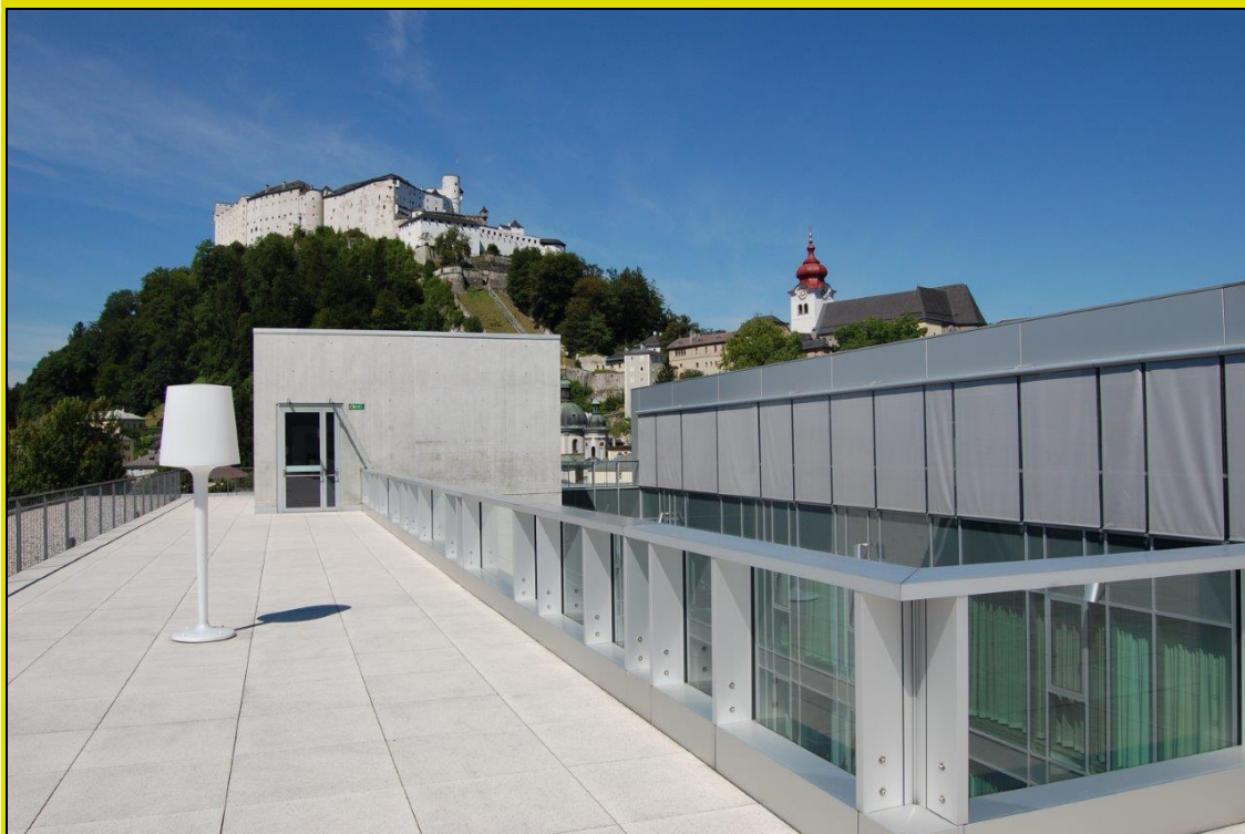
The University of Salzburg